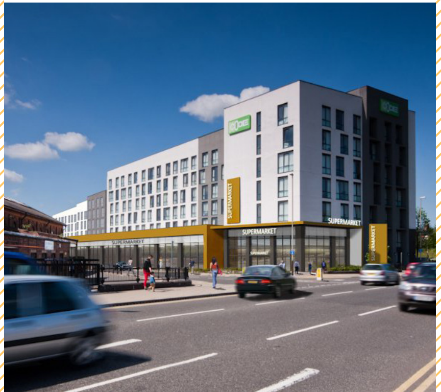
Upperton Rd Leicester, Student Accommodation

To stay ahead of the game student accommodation providers will need to provide top quality facilities with an array of added extras which don't necessarily cost the earth.