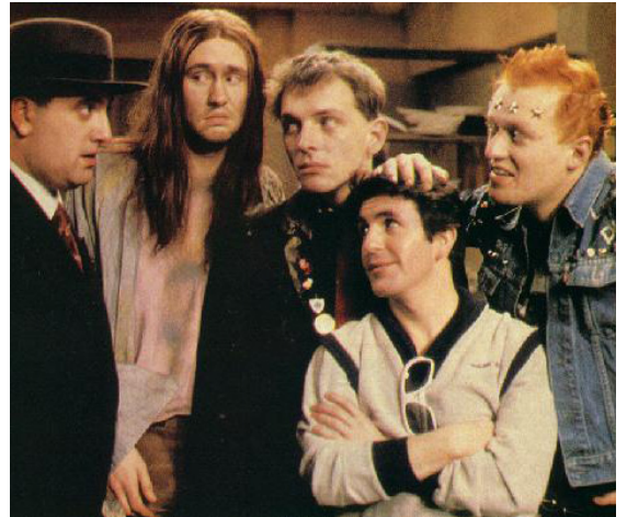
Student Life in the Eighties

Mature students and couples are also a growing clientele requiring more bespoke accommodation.